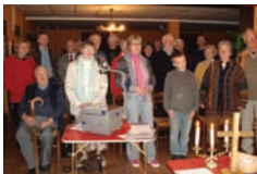
The service in the café

The church has a reputation for being welcoming, warm and responsive. They are not a congregation to be easily fazed either! On Sunday 20 April the organiser discovered that a double booking had been made for the day. Instead of the Prayer and Praise Service for the members of the congregation, it was discovered that the Bishop of Perigueux would be presiding at a baptism in the church.