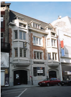
Holy Trinity, at the heart of Brussels