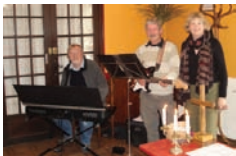
The congregation's worship leaders