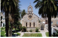
St. George's Church