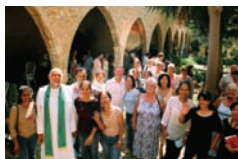
Making disciples of all nations in Famagusta, a new church part-funded by ICS

Second, we are to 'make disciples of all nations ' (v19). ICS is one of those mission agencies that takes this seriously and