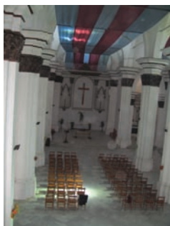
St. Mary's Tripoli (interior)

We left Addis Ababa at the end of July and, after seeing family and friends in the UK, expect to take up the appointment in Tripoli at the end of August. Tripoli will be very different from the happy muddle that is Addis Ababa, as it is a large modern city with wide roads, proper pavements, big shops, modern cars and evident wealth. When Colonel Gaddafi took over thirty-eight years ago, all the churches were put under state control and many changed to mosques, libraries or art galleries. The old garrison church of Christ the King was closed and the few remaining Anglicans were allocated a first floor flat for their services.