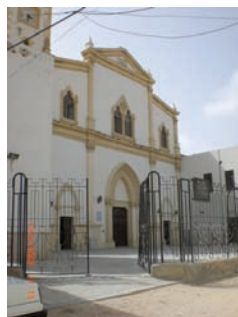
St. Mary's Tripoli (exterior)